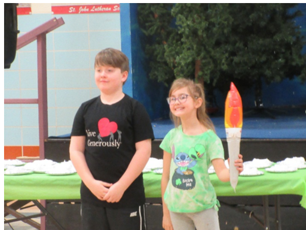
Top 2 Students