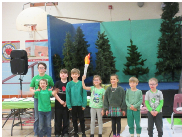
Students Who Participated