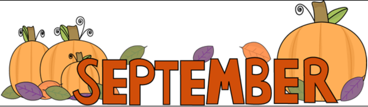
September 2021 Youth Calendar